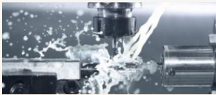
DEGREASING Degreasing waste liquid