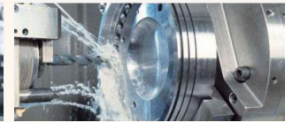
HIGH-COD High COD waste liquid