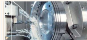
CUTTING Cutting waste liquid