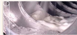
HOT-ROLLING Hot rolling waste liquid